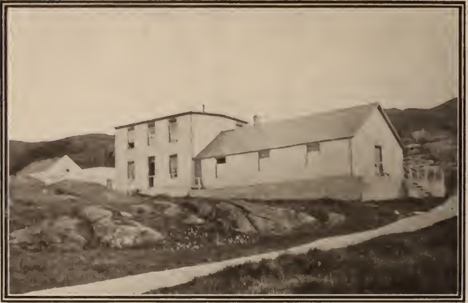
THE GRENFELL MISSION HOSPITAL AT INDIAN HARBOR, LABRADOR

dustrial school; for the endeavor is made to teach the people some industrial arts, in order that they may not be so absolutely dependent upon the cod-fishery. All during the summer the entire coast of Labrador is dotted with fishing schooners that go "down north" after the codfish. This industry, that has been the mainstay of the people for many years, has produced an absolute reliance upon the fishery as the sole means of livelihood. When this fails a vast number of people are practically penniless. But until Dr. Grenfell came to this coast the people had hardly any medical attention save for the spasmodic visits of a physician who was sent down by the government during a part of the summer. It was to relieve this severe need and the consequent distress that caused Dr. Grenfell to establish his hospitals and to send the mission steamer along the coast on errands of mercy to heal the sick. The spirit of the enterprise is well described by the inscription on